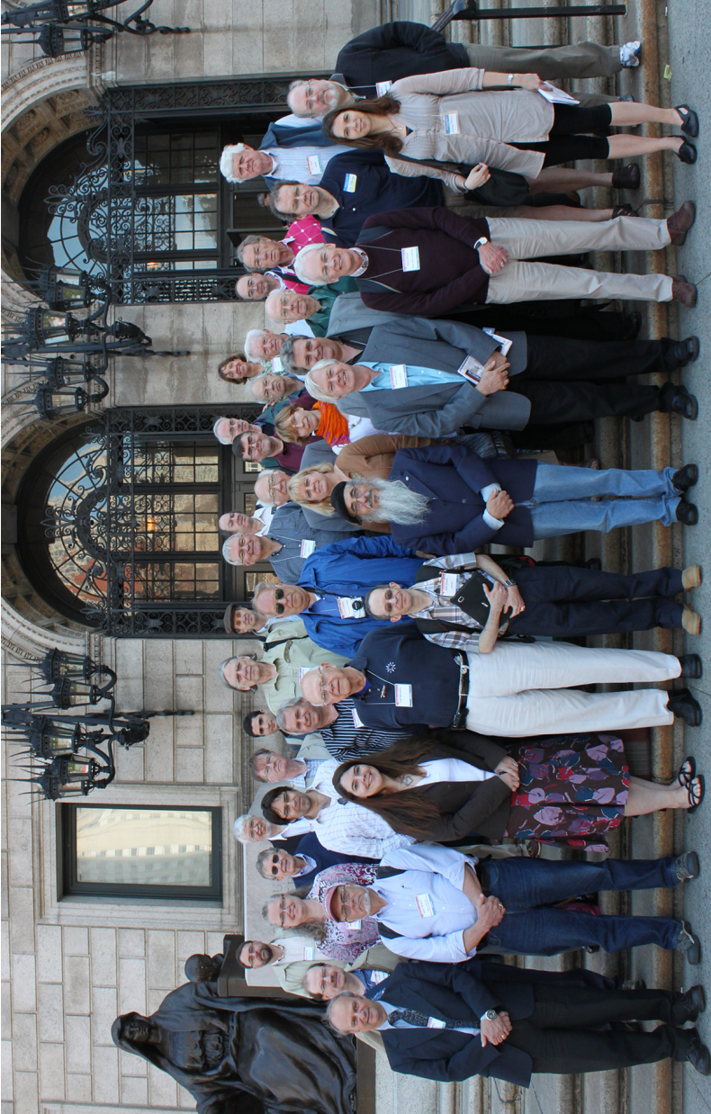
The 100th Spring Meeting of the AAVSO, Boston, Mass., May 21–25, 2011